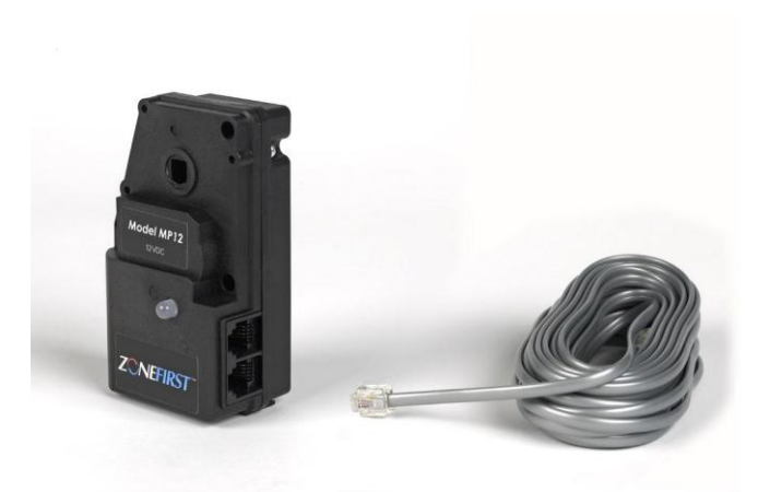
Actuator & 25' of modular cord included with each damper

The RRP motor also has a two-color Light Emitting Diode (LED) to indicate the damper position. When the LED is GREEN the damper is Open . When the LED is RED the damper is Closed . When the LED is not lit the motor is typically moving between open and closed. The motor cycles between open and closed in less than 5 seconds